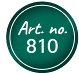
Rayotabs lactose tablets (1 x 126 pieces)