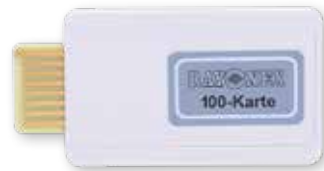
Memory card for 100 (empty)