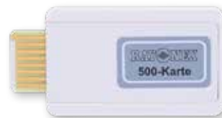
Memory card for 500 (empty)