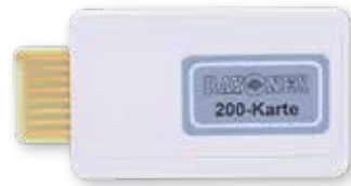
Memory card for 200 (empty)