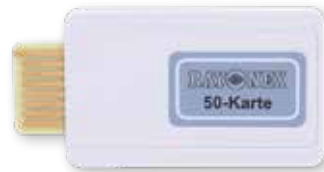
Memory card for 50 (empty)

A total of four different memory card types are available, which differ in their memory capacity. There are memory cards with a capacity of 50, 100, 200 and 500. The number indicates the maximum number of interferences that can be stored. There is also an inexpensive memory card set available that contains a larger number of memory cards.